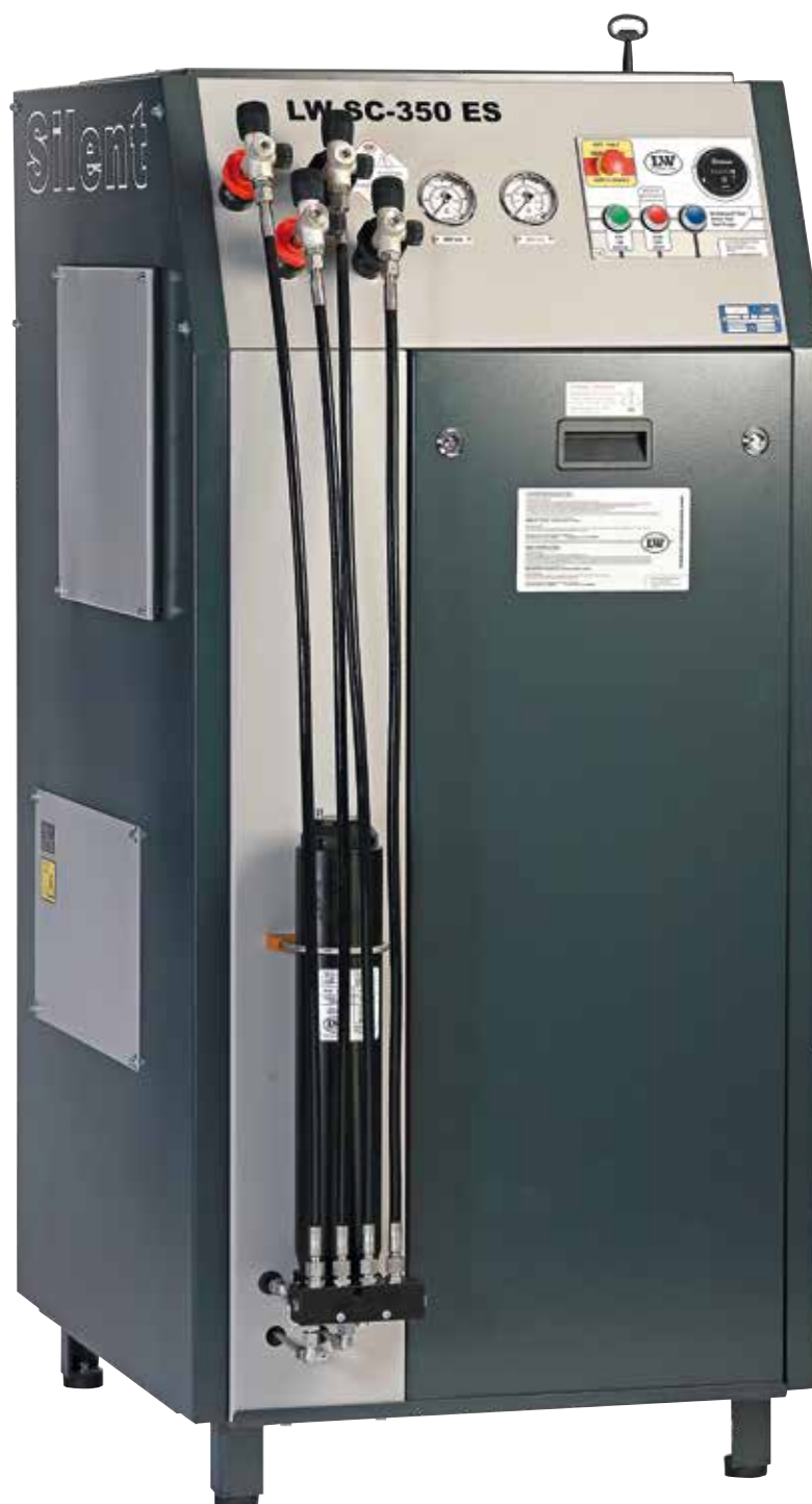
Figure with following options:

All models focus on high reliability, easy to operate and customized equipment.