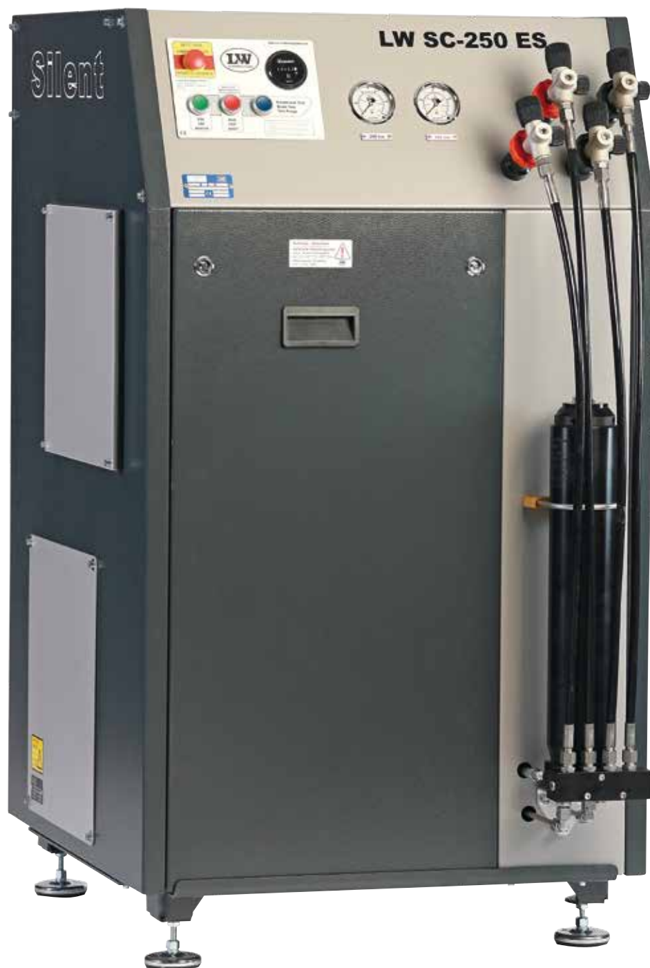
Figure with following options:

All models focus on high reliability, easy to operate and customized equipment.